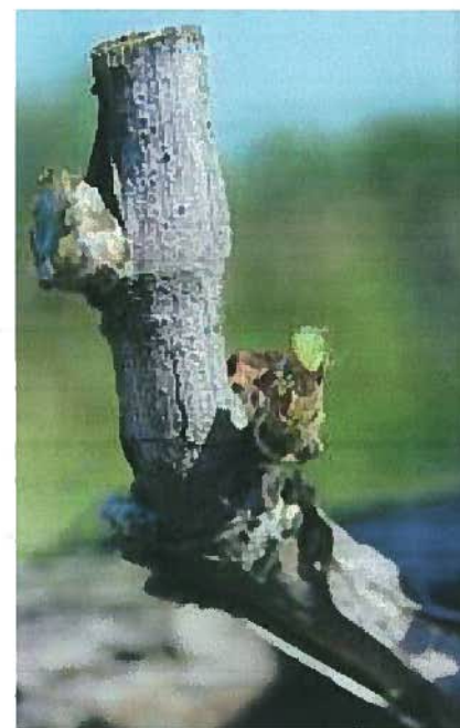
Treatment consisting of cutting damaged shoots with shears, leaving basal green tissue

The average yield of the Chardonnay block in our study is 3.9 tons per acre in most years. The average yield of the Cabernet Sauvignon block in our study is 3.6 tons in most years. The remainder of the Cabernet