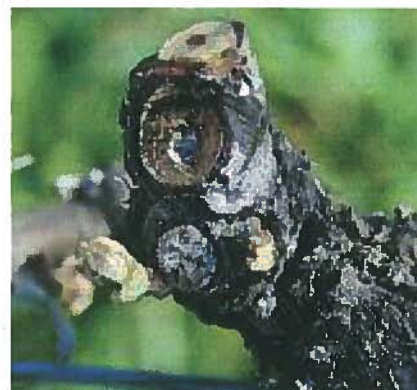
Cut damaged tissue and one-year-old wood off of spur with shears, to stimulate basal buds.

Whether it makes sense to do any manipulations following freezing is questionable, and depends on the variety and need for the particular fruit.