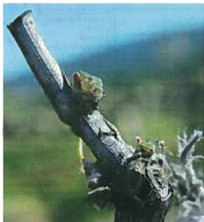
Treatment consisting of breaking damaged new growth off by hand.

Evidently there are bud primordia or dormant buds that then grow — there were significantly higher stem numbers on the spur positions in the treatment in which we cut damaged shoots, as well.